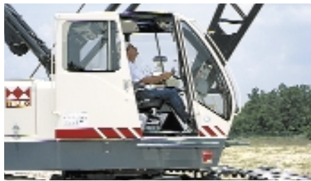
Environmental operator's cab

Max. Lifting Capacity: 60 tons (54.4 mt)