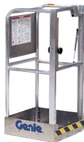
Gated Ultra Narrow Platform