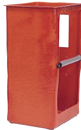
Fiberglass Narrow Platform