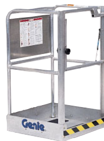
Gated Standard Platform