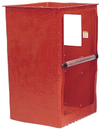
Fiberglass Standard Platform