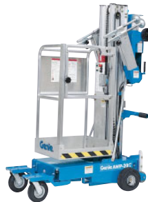
Rough Terrain Base